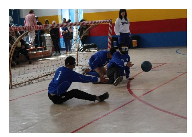
Able-bodies students were blindfolded