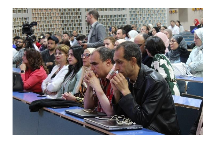
The presence of disabled people was significant among teachers and students

A two-day stay at the International Centre for the Advancement of People with Disabilities for disabled students was a very successful experience in terms of communication between them. They took an interest in several workshops (painting, theatre, jewellery making .....).