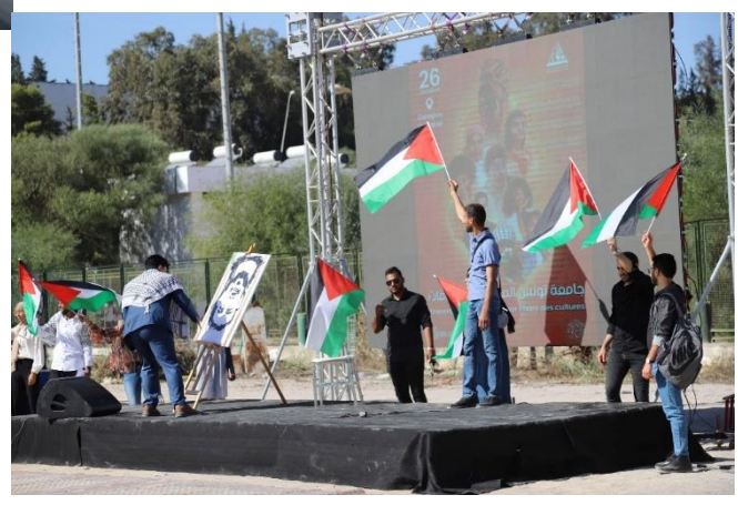
The Dabka dance

The event was covered by the media: newspapers, radio and TV. Here is the live transmission from Radio Jeune