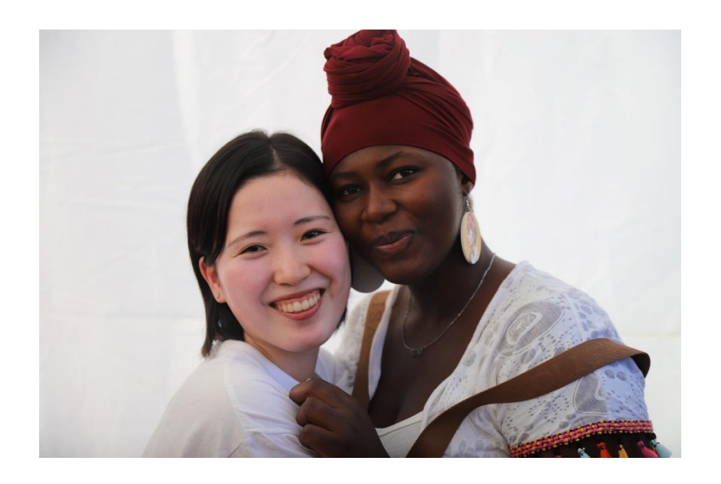
One of the photos of the event that caused a buzz on social networks denouncing all forms of racism