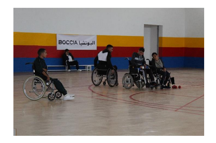
Able-bodied students took part in the wheelchair match