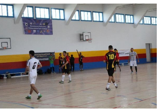
Football for the hearing impaired: able-bodied students had their ears plugged.