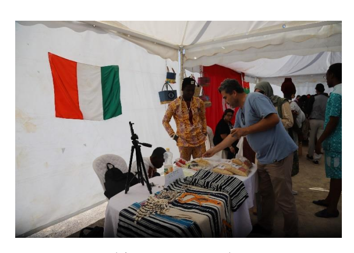
Burkina Faso stand