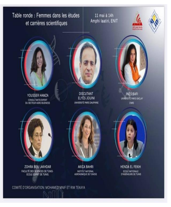
ENIT : la Tunisie a la part la plus importante de femmes chercheuses dans le monde arabe – Managers